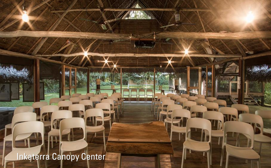
Inkaterra Canopy Center