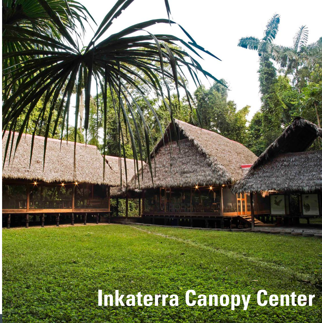
Inkaterra Canopy Center

Located 20 minutes-walking from Amazon Field Station by Inkaterra. The area is designed for conferences, training sessions, expositions and other events, and maintains the illustrative panels of the Canopy Interpretation Centre as visual décor.