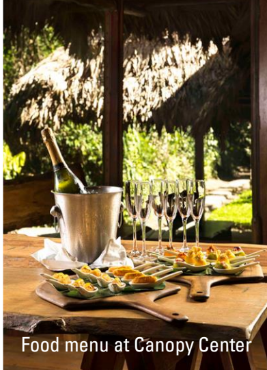
Food menu at Canopy Center