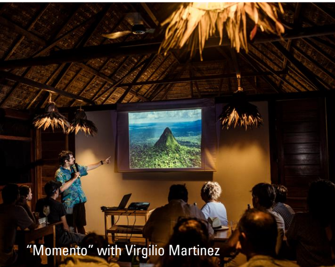
"Momento" with Virgilio Martinez