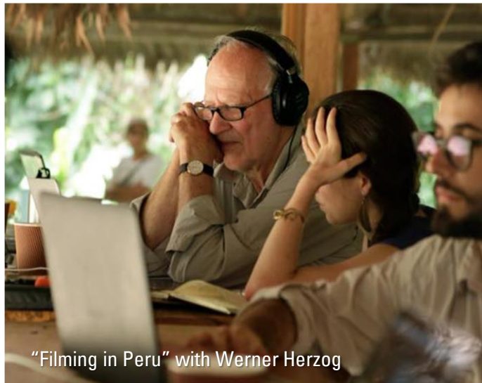
"Filming in Peru" with Werner Herzog