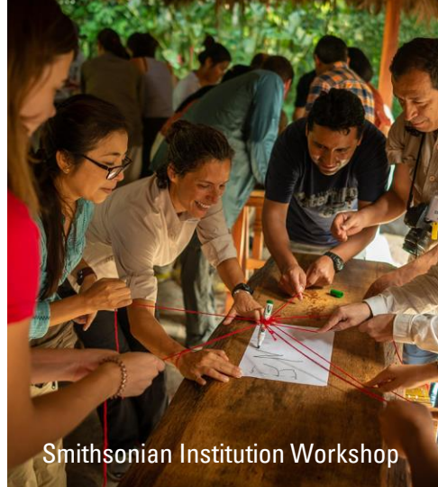
Smithsonian Institution Workshop