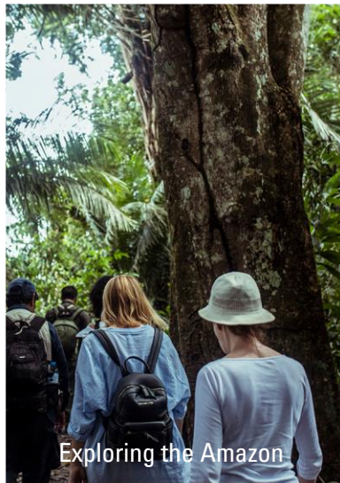
Exploring the Amazon