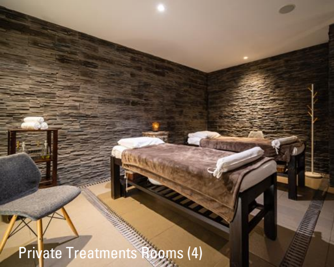
Private Treatments Rooms (4)