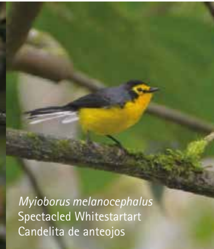
Myioborus melanocephalus Spectacled Whitestartart Candelita de anteojos

From April 1st to 30th, from 6:00 a.m.-16:30 p.m., a male and two female Andean Cocks of the Rocks ( Rupicola Peruviana ) were spotted at orchid trails I and II, entrance, lobby, dining room, blocks 20, 30, 40, 50, 60, 70, 80, 90, sacred rock, camping, tea house, Andean Bear Rescue Center, railway km 108-109, and the Andean Bear Semi-freedom Program. The male and two females were seen perched and eating fruits: Nectandra furcata "Yanay Argoz", Inga adenophylla "Pacaemono", Chamaedorea pinnatifrons "Palmera tipo bambú", Myrsine pseudocrenata "Chalanque", Heliconia sp. "platanillo". It habitates in cloud forests, it belongs to the Cotingidae family, and is noticeable for its incredible plumage.