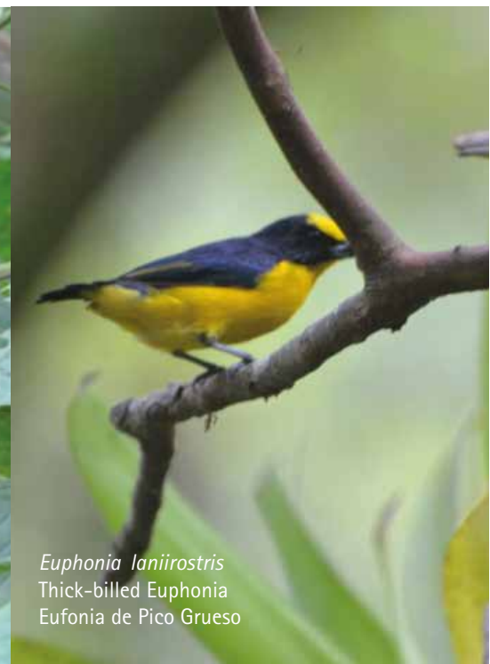
Euphonia laniirostris Thick-billed Euphonia Eufonia de Pico Grueso