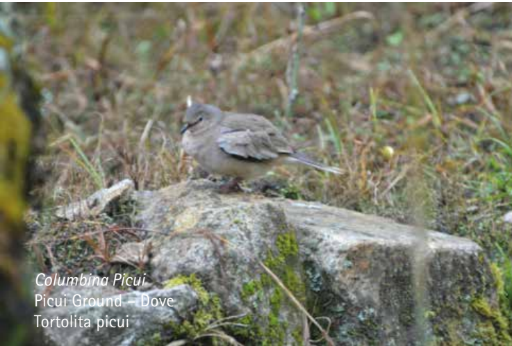
Columbiga picui Picui Ground – Dove Tortolita picui