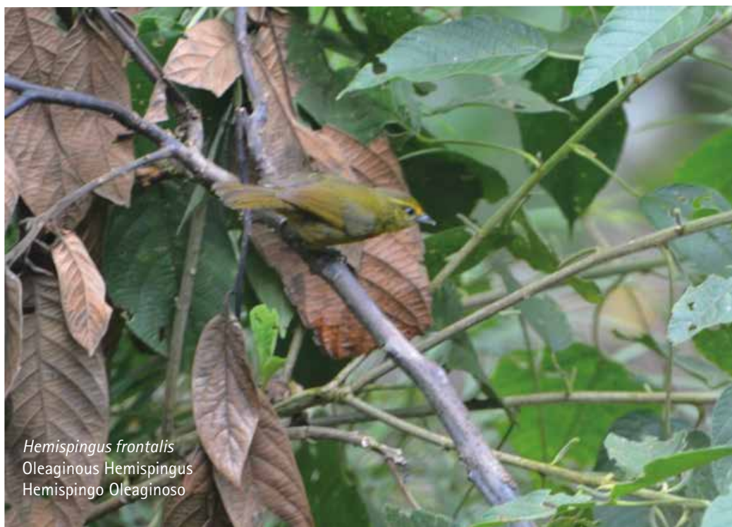
Hemispingus frontalis Oleaginous Hemispingus Hemispingo Oleaginoso