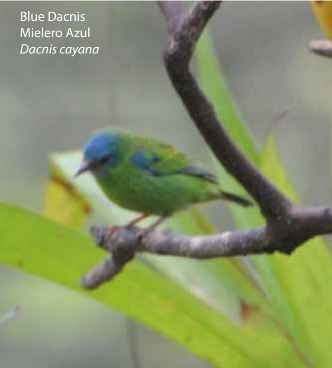
Blue Dacnis Mielero Azul Dacnis cayana