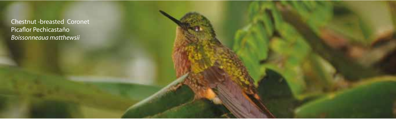
Chestnut-breasted Coronet Picaflor Pechicastaño Boissonneaua matthewsii

From May 1 to 31, the following bird species were spotted at orchid trails I and II, entrance, lobby, dining room, blocks 20, 30, 40, 50, 60, 70, 80, 90, sacred rock, camping, lobby, tea house, Andean Bear Rescue Center, railway km 108, and Andean Bear Semicaptivity Program. From 6:30-9am and 15:00-17:00pm, are the best hours to observe birds at cloud forests where the following trees outstand: Erythrina falcata "pisonay", Nectandra furcata "yanay argoz", Inga adenophylla "Pacaemono", Juglans neotropica "nogal", Myrsine pseudocrenata "chalanque", Piper elongatum "matico", Weinmannia pentaphylla "Huichullu" arbustos como Chamaedorea pinnatifrons "palmera tipo bambú", Geonoma undata , Fuchsia boliviana .