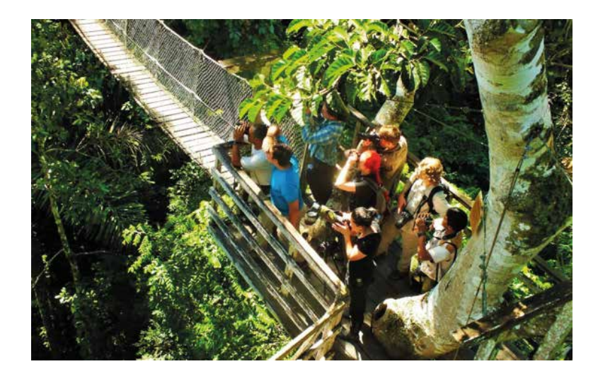
Photo N°2.- Team Inkaterra during sightings on the Canopy Walk Way.

The team conducted sightings were within Inkaterra Reserva Amazónica and surroundings, Gamitana Chacra Agroforestry Station, the Canopy Walk Way, the swamp, Lake Sandoval and the trail system. The group recorded a total of 137 species. In Peru, Madre de Dios and Cusco were the regions that recorded the most number of birds.