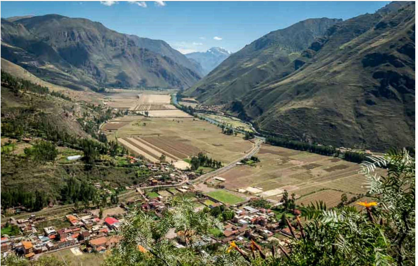
The beautiful and fertile Sacred Valley in Peru