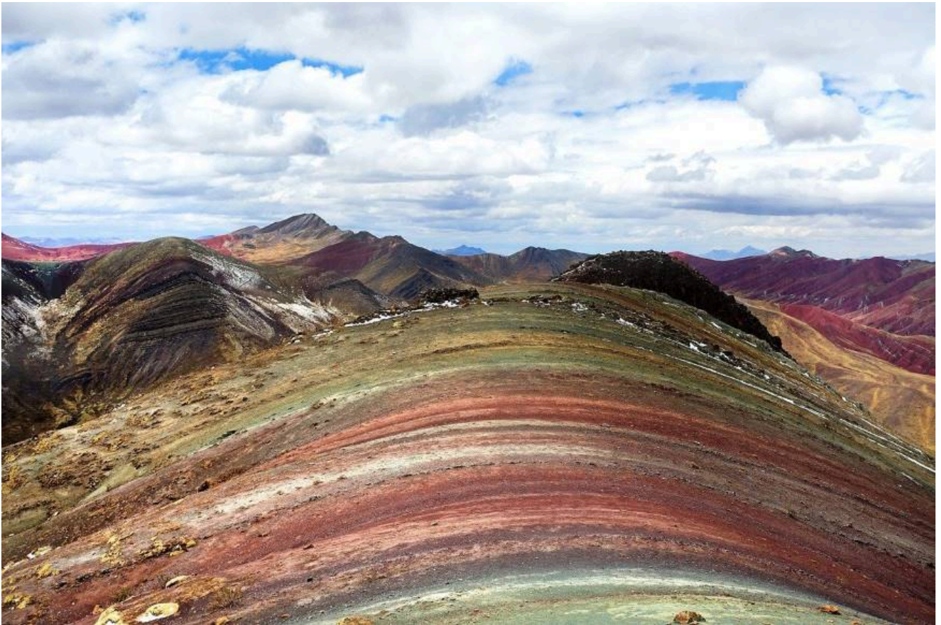
Go for a walk on a rainbow in Peru