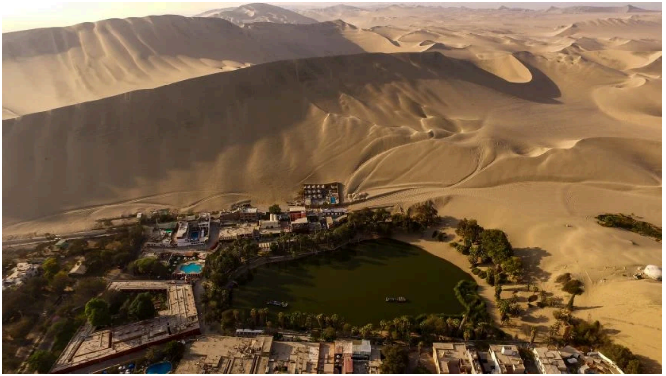
The desert oasis of Huacachina