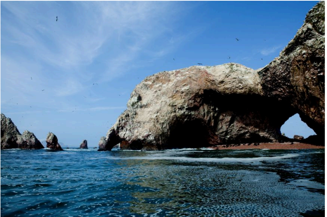
Interesting rocks and lots of wildlife to be seen on Islas Ballestas