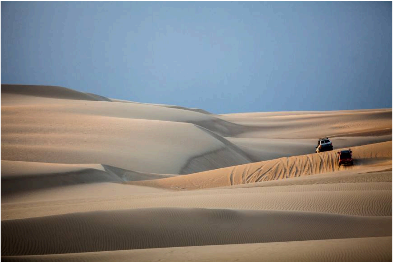
Exploring the coastal desert of the Paracas National Reserve

Islas Ballestas is an archipelago of islands that's part of the reserve. It is peppered with tunnels, arches and rock carved by the wind and sea that are typically visited as part of a 2.5-hour boat tour.