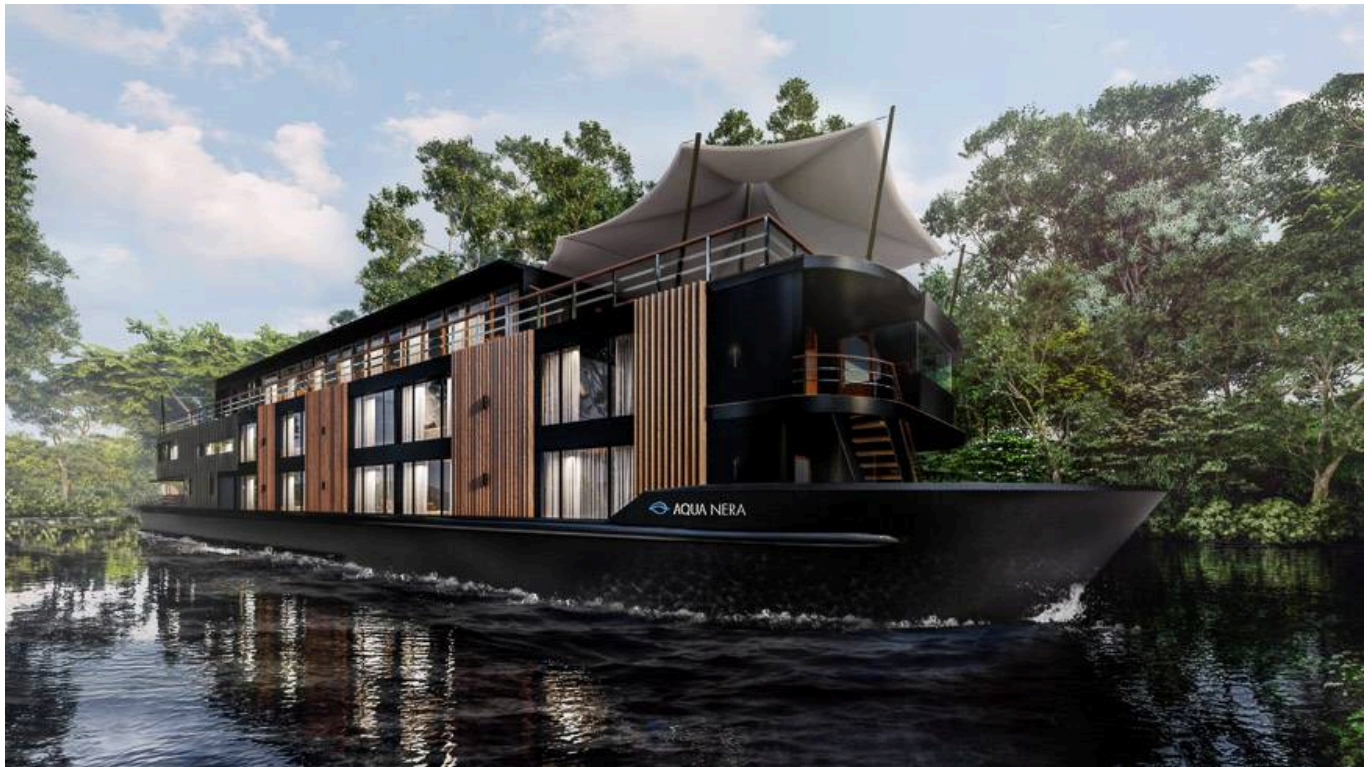
Exploring the Amazon on a luxury boat with Aqua Expeditions

even closer to nature. This is the way I envision experiencing the Amazon, a once in a lifetime experience for sure!