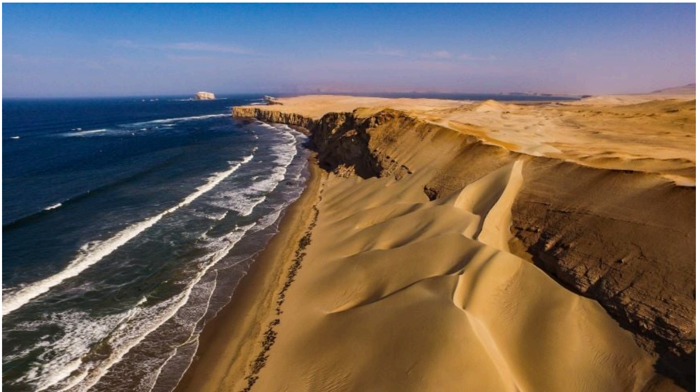
The stunning beaches and dunes of Paracas

The reserve is also a place of great beauty – cue the sand dunes, part of the driest desert in the world contrasted with the rich blue of the Pacific Ocean. There are many stunning beaches, though most aren't safe for swimming.