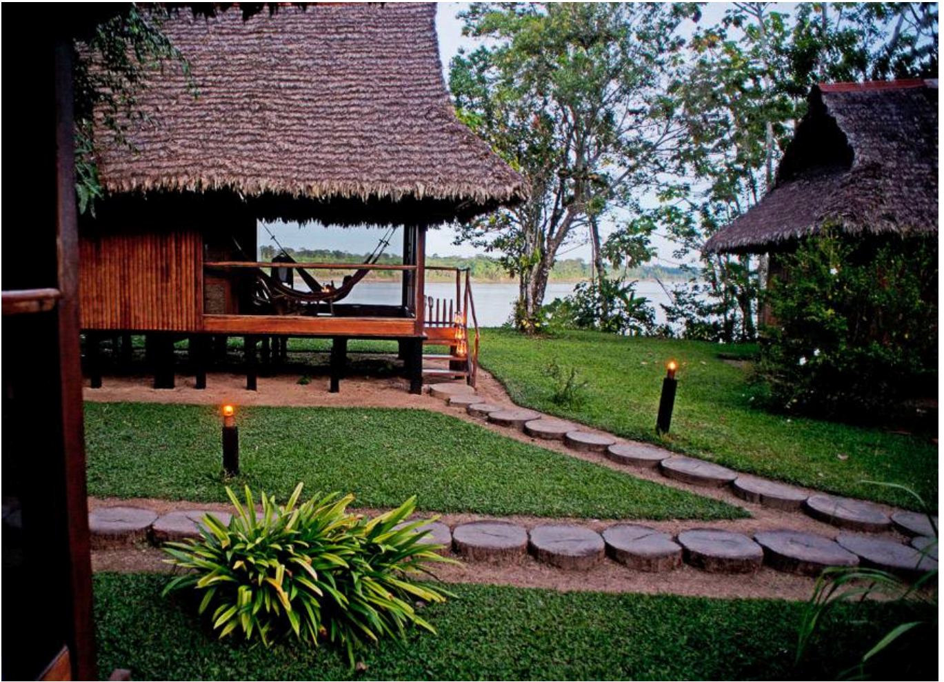
Inkaterra cabins in sight of the Madre de Dios River