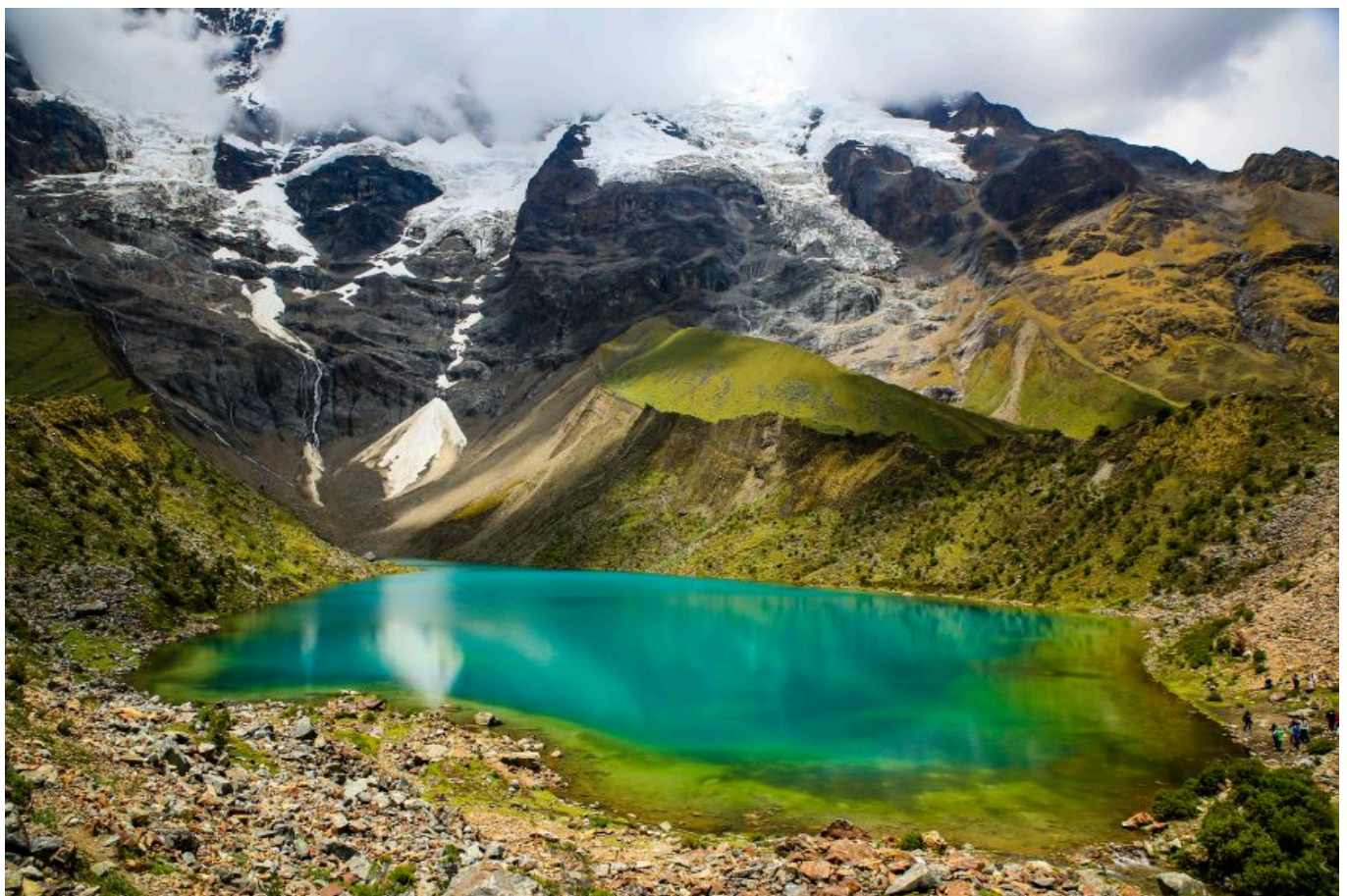
Laguna Humanta – Photo credit: Enrique Nordt /PROMPERÚ

Humantay Lake is at altitude – 5427 m or 13,900 feet to be exact. When you visit, be sure to drink lots of water and have Advil at your disposal.