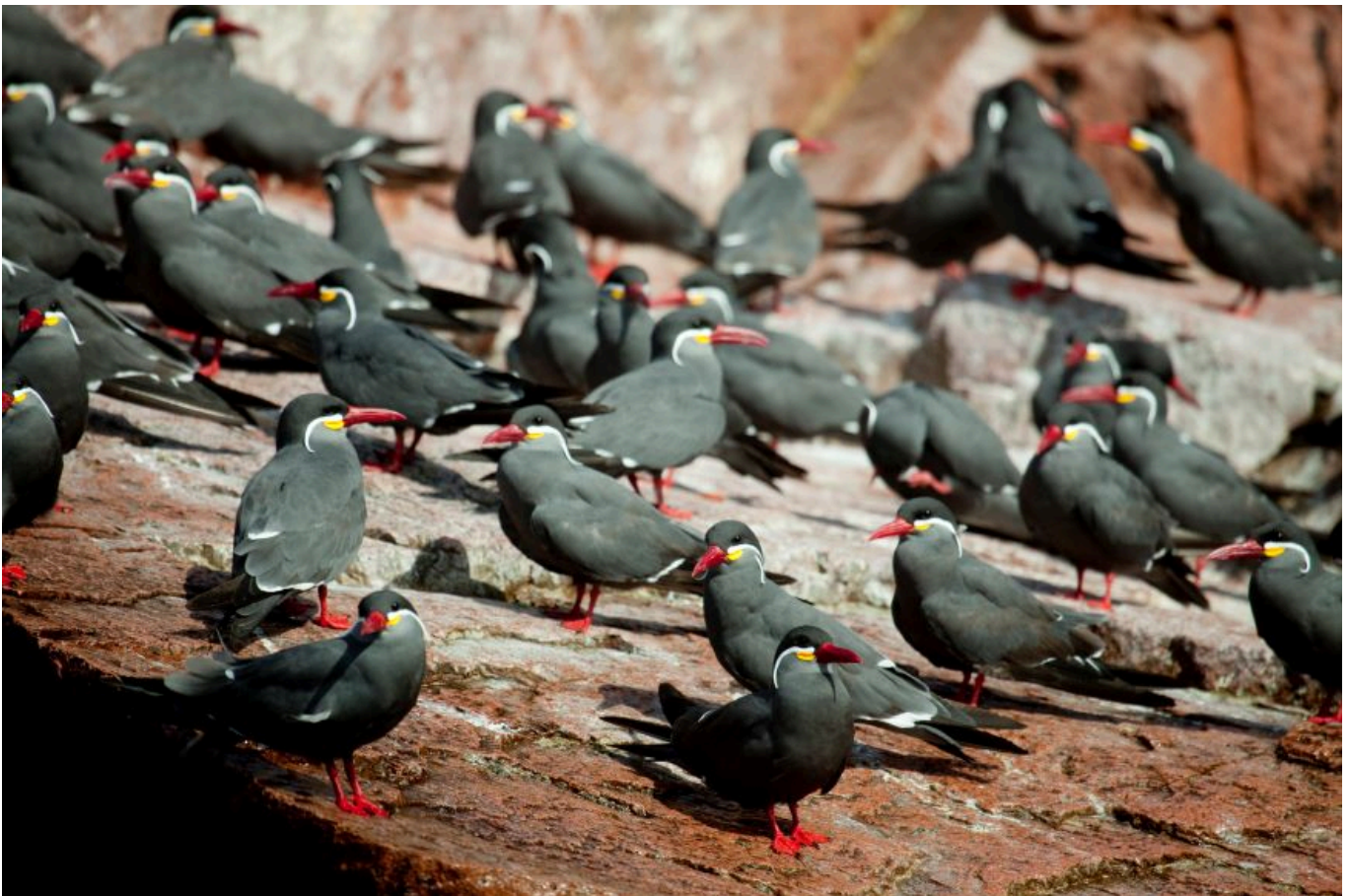
The Inca Tern seen on las Islas Ballestas