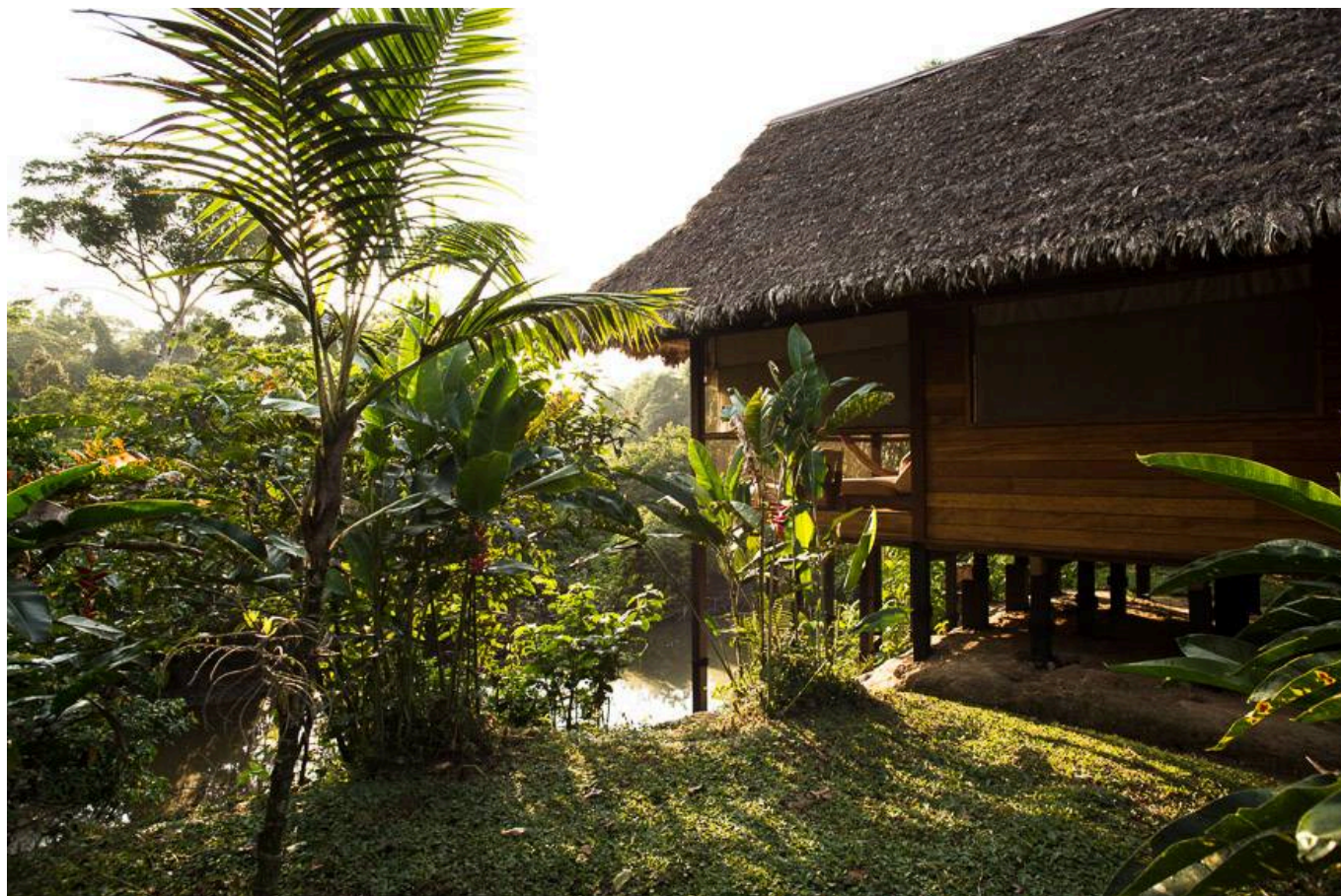
A cabana on stilts at Inkaterra Hacienda Concepción

A stay here offers a chance to see giant river otters, caimans, and howler monkeys.