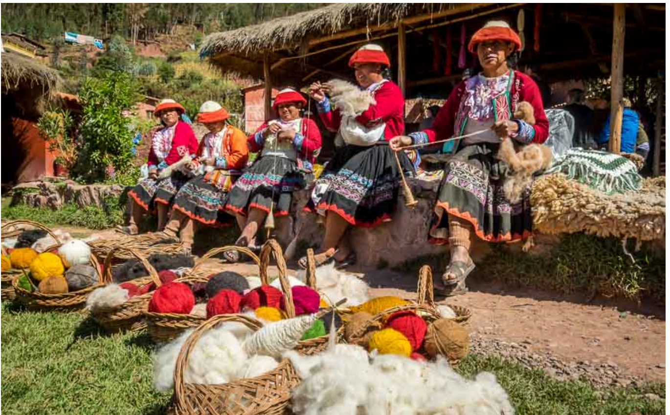
Indigenous women hard at work at the Caccacollo Women's Weaving Co-op