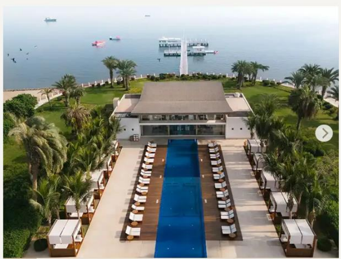
Hotel Paracas, an idyllic seaside escape of Marriott's Luxury Collection

Morning boat tours visit the wildlife-rich Ballestas islands, home to vibrant marine life including sea lions and penguins. Explore the nearby Paracas National Reserve, a wonderland of dramatic cliffs, remote beaches, and awe-inspiring dunes. Sample Peru's national spirit at a Pisco-producing vineyard, then speed through the Huacachina oasis in a sandbuggy or embark on a scenic flight above the mystical Nazca Lines from the nearby Pisco Airport.