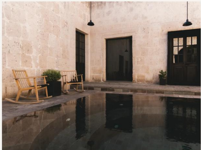
Cirqa, a former monastery set in the heart of Arequipa's

Explore the city's heart on foot - iconic landmarks like Santa Catalina Monastery and Plaza de Armas are just a short stroll away. The concierge can arrange experiences like cooking classes, food tastings, or even white-water rafting adventures. Once back at the hotel, a lovely plunge pool and dedicated spa treatment room awaits.