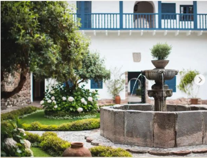
Tranquil cloistered courtyards with historic water fountains

Cusco, the ancient heart of the Inca Empire, offers a wealth of historical and cultural treasures to explore. Experience the epitome of luxury at Belmond's Palacio Nazarenas, ideally located between Plaza de Armas and the artsy San Blas neighborhood. The former convent has been meticulously restored, and seamlessly blends colonial architecture with modern amenities and impeccable service.