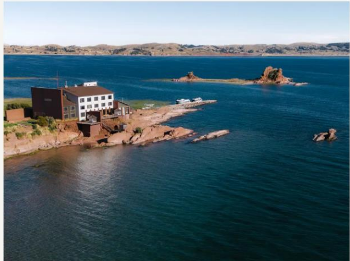
Titilaka, a remote Relais &amp; Châteaux property on the banks of Lake Titicaca &gt;