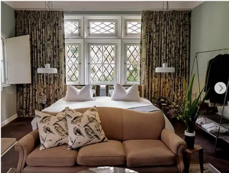
Atemporal, a charming six-room hotelito in Lima's Miraflores district

Published August 2024 How we choose hotels