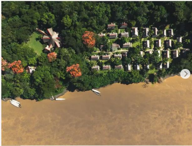
Reserva Amazónica, an eco-luxury lodge in front of Madre de Dios River