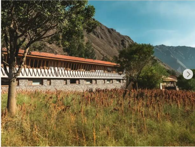
Explora, set in a peaceful and rural part of the Sacred Valley