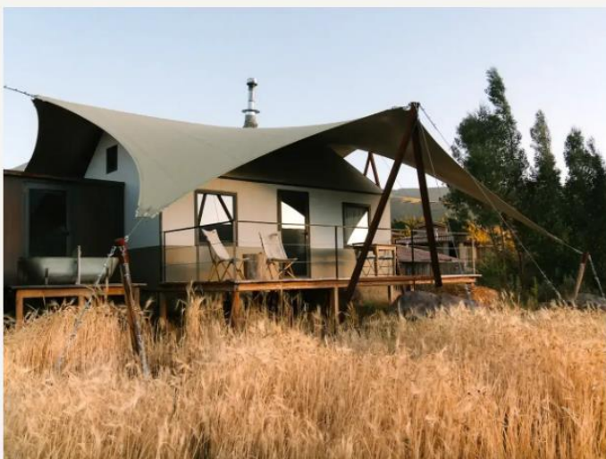
Puqio, a first-of-its-kind tented camp, perched on the edge of Colca Canyon's

A wealth of tailor-made explorations, from trekking and mountain biking to horseback riding, are offered in small groups and with passionate guides. Discover pre-Inca terraced farms, historical sites, geysers and volcanoes, sweeping viewpoints for condor sightings, and nearby communities with markets and textile weavers. After a day of high-altitude adventures, unwind with a rejuvenating massage in the spa tent or a soothing soak in the hot tub.