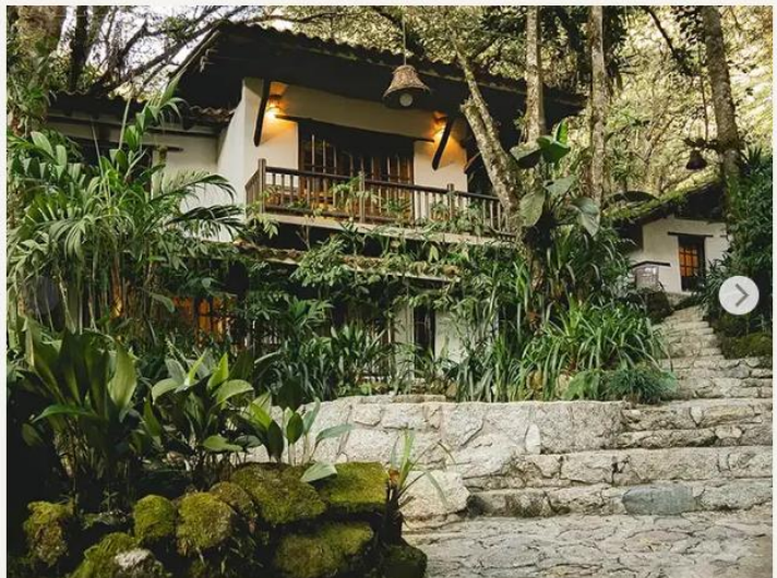
Inkaterra Machu Picchu Pueblo, set within a five-hectare mountainside reserve

Nestled within a pristine cloud forest garden, the 85 colonial-inspired casitas exude a cozy and authentic ambiance, many featuring romantic log fires and select suites boasting plunge pools and open-air showers. Common areas, connected by cobble footpaths, include a library, a delightful café, and a glass-walled restaurant with a bar. Unwind at the serene Unu Spa , featuring a springwater pond and a traditional Andean eucalyptus sauna. Wander through the enchanting hotel grounds, where over 370 species of native orchids can be found. Inkaterra also offers complimentary tours on-property, including birdwatching and a visit to their own tea plantation.