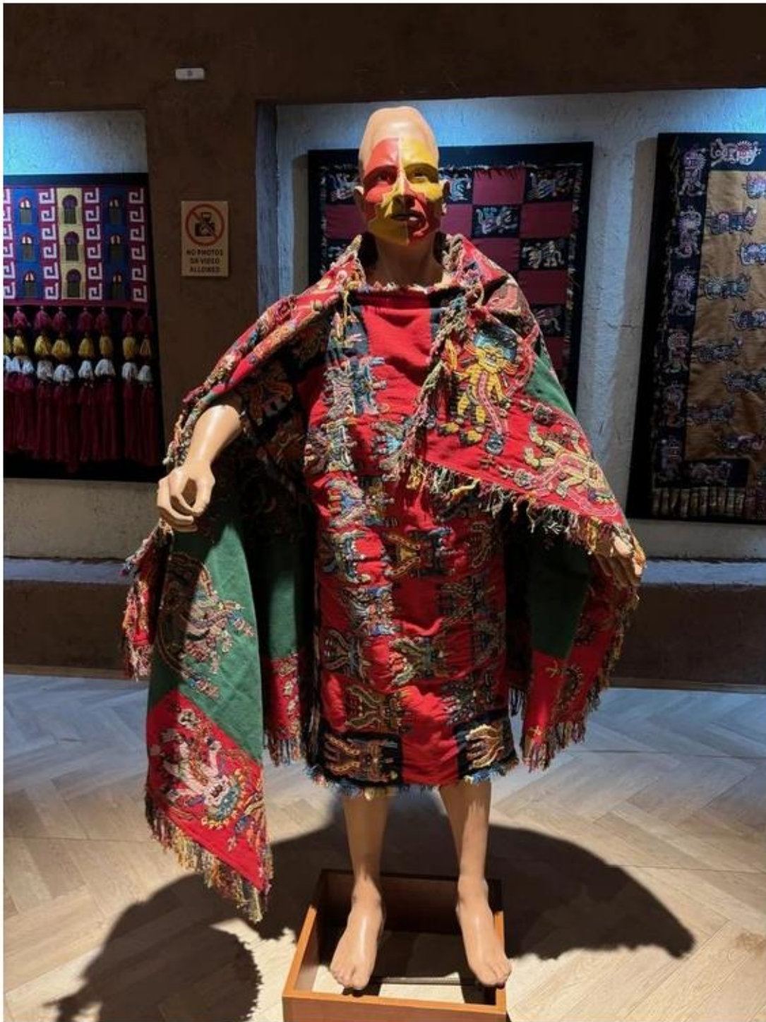
The Sulca family textiles museum in Cusco, Peru.

The Saqsaywaman (or “sexy woman,” as our guide joked to help our pronunciation) archeological complex of walls of stone fit together without mortar, as well as the nearby Jesus statue reminiscent of Christ the Redeemer in Rio, are on a hill and offer great views of Cusco.