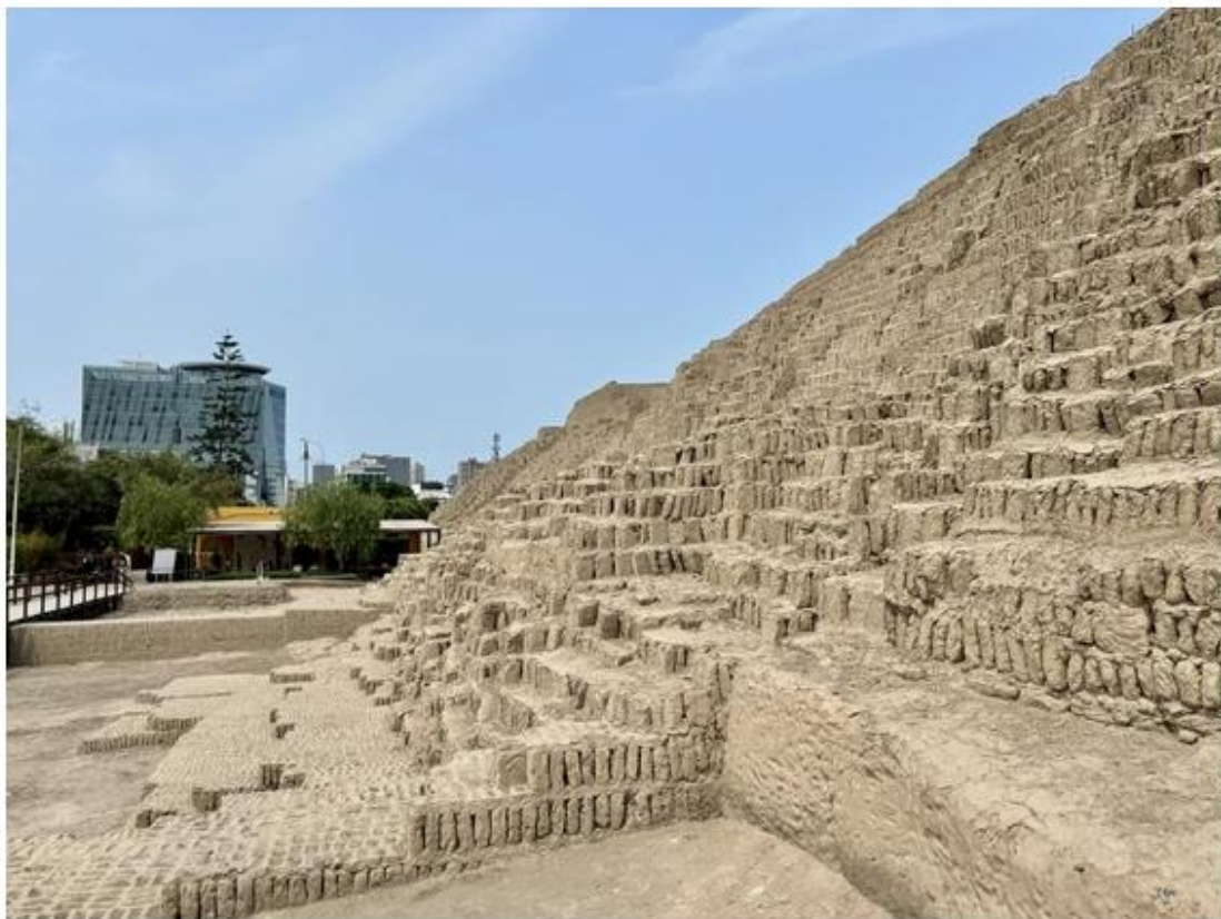
Huaca Pucllana adobe and clay pyramid built from seven staggered platforms sits in the Miraflores district of central Lima, Peru.

The soupy fog coming off the Pacific Ocean and hovering over the coastline on our arrival in Peru's capital city was what our guide, with a smile, told us the locals call "donkey's belly." Luckily it didn't last our whole visit and we got clear views driving along the oceanfront with massive cliffs to one side and waves and surfers on the other. It's a sight to behold – and you'll have plenty of time to ogle it as Lima daytime traffic makes Toronto's Gardiner Expressway feel quick. We suggest letting locals do the driving for you!