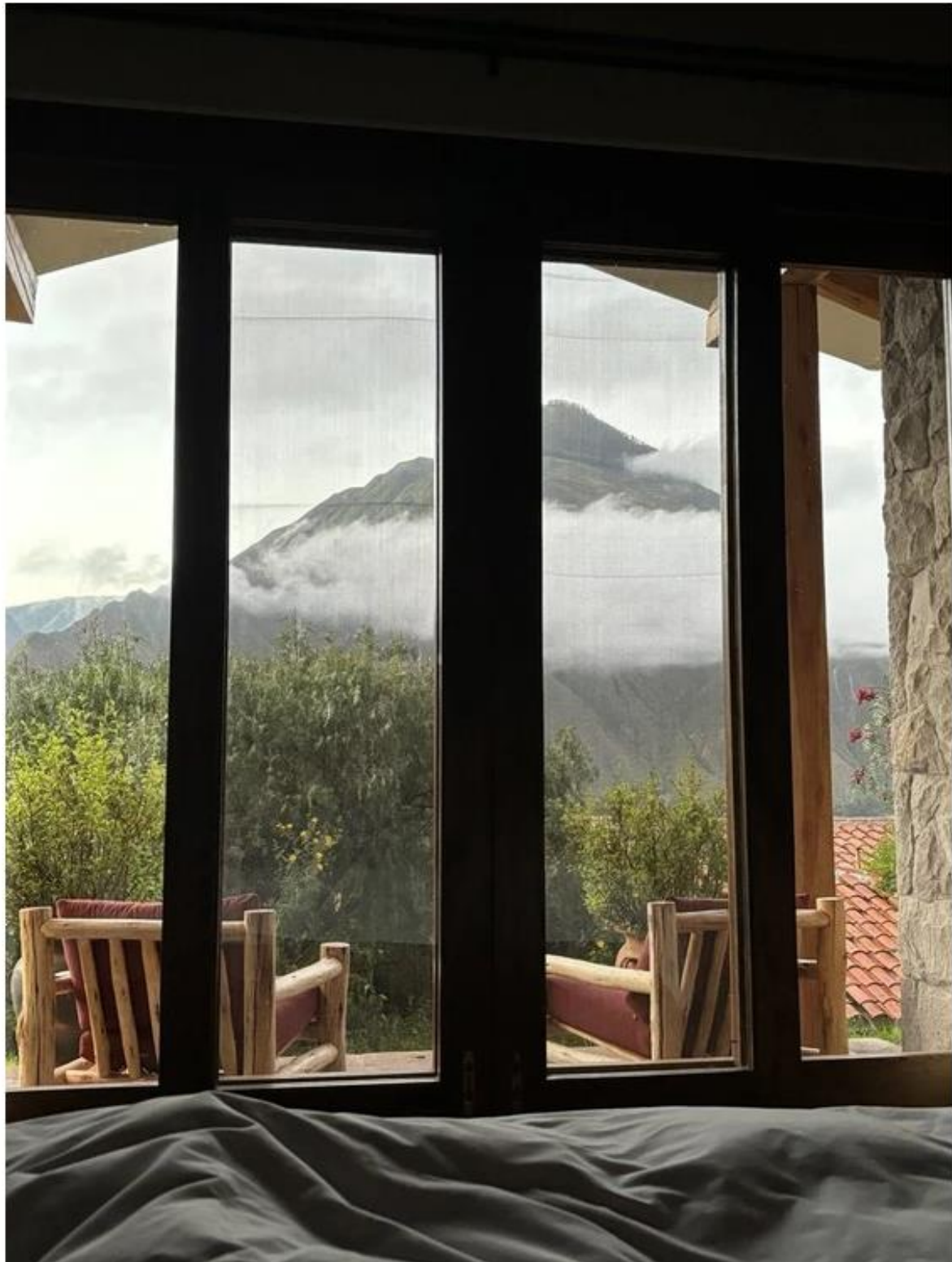
The clouds appear touchable from bed in one of the casitas at Inkaterra Hacienda Urubamba in Sacred Valley, Peru.

Everything about being in Sacred Valley was mind-blowing, especially our accommodations at Inkaterra Hacienda Urubamba . Set on a mountainside with a main building, spa and casitas (small houses), and decorated with items made by local artisans, the five-star boutique hotel provided an authentically Peruvian stay that prepared us for the main event.