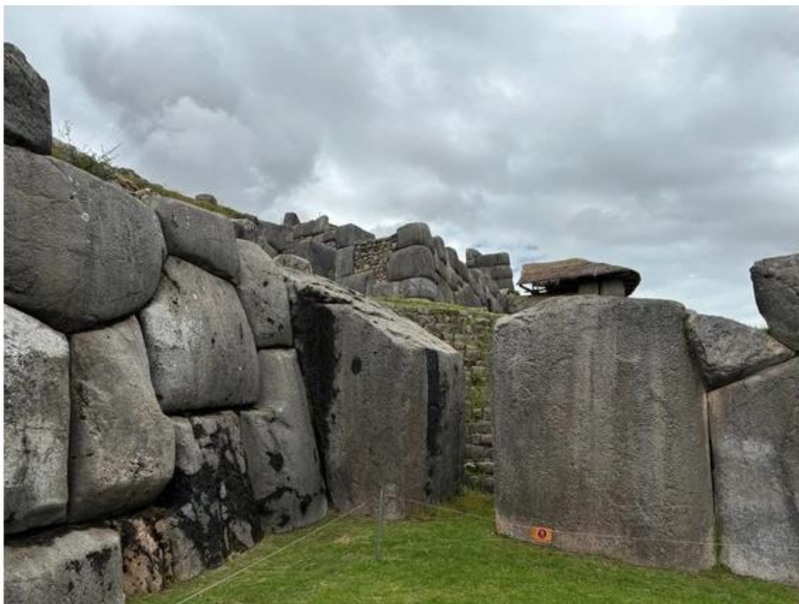
It is hard to fathom how the Incas in the 15th century assembled these massive stones at the Saqsaywaman archeological complex in Peru.

Nearby you must see the 12-angled stone, an example of the Incas’ perfection and skill, as well as Santo Domingo convent and sacred Inca temple Qorikancha.