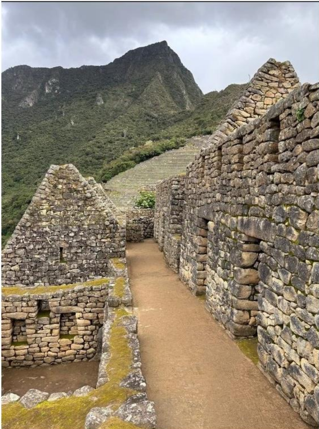
The skill of the Incas on display at 'Lost City' Machu Picchu in Peru.

The train is a throwback – in a wonderful way – with meal service at your assigned table and a glass-ceiling bar car in the rear that was the hotspot for fun with music and dancing and great daytime views of Sacred Valley. We then were transferred to a bus and driven up the switchback mountain (don't look out the window if heights are an issue for you!) to the historic site, where our guide pointed out the incredible Inca architecture. It truly is a remarkable place that exceeded all my expectations.