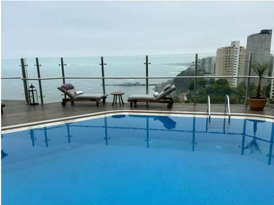
The infinity rooftop pool at Miraflores Park in Lima has views of the Pacific Ocean and coastline.