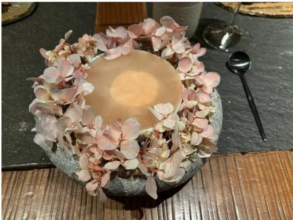
A stone bowl with petals holds a dessert of camu camu, melipona honey, copoazu and macambo at Mayta in Lima, Peru. You crush the cover and it’s creamy goodness.

– Mercado No. 28 Miraflores opened in 2018 as the first gastronomic market in the country. Located on the second floor with light pouring in from the roof, it has more than a dozen food and drink options. Another location opened in 2021 in the city’s Surco district.