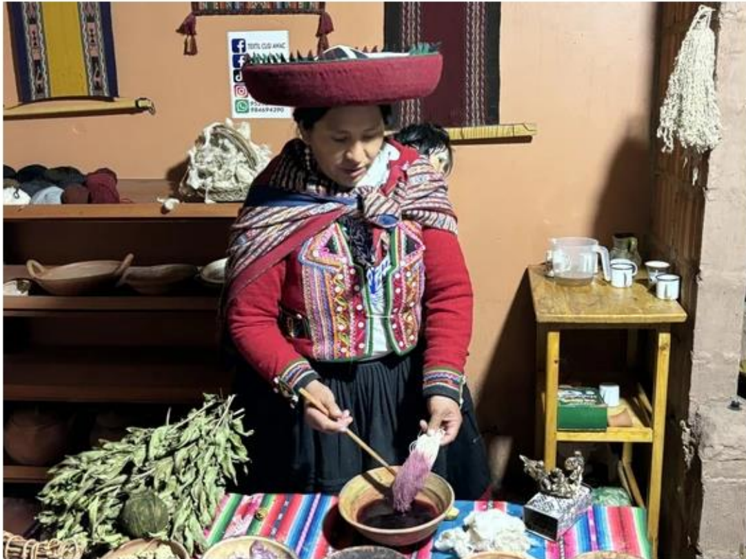
One of the ladies at Textil Cusi in Chinchero, Peru wears traditional clothing while demonstrating how the alpaca wool is dyed.

We also paid a visit to Chinchero, which eventually will be the site of an international airport. Textiles is the main industry and at Textil Cusi we learned from the ladies how they dye wool. They also have wonderful clothing and souvenirs for sale.