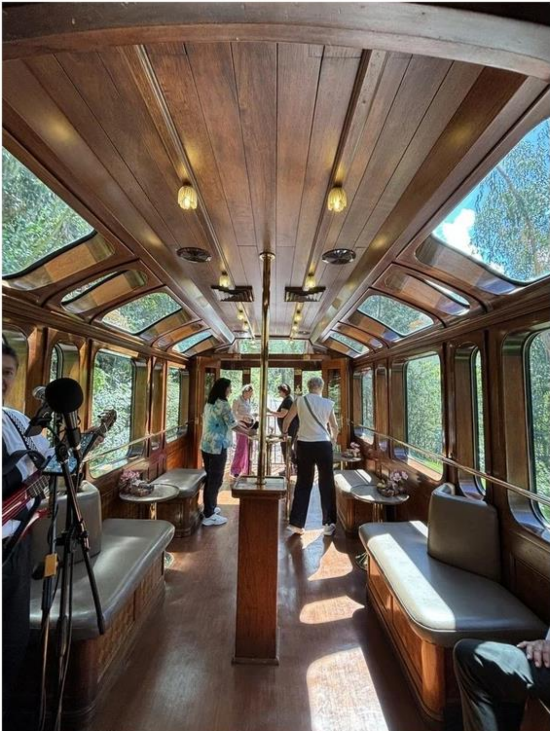
The last car aboard the Hiram Bingham train to Machu Picchu has live music and fantastic views.

Instead of hiking, our route to reaching the UNESCO World Heritage site – one of the new Seven Wonders of the World – matched the elevated experience of our rest. The Hiram Bingham train is named for Hiram Bingham III, the American explorer and politician who rediscovered Machu Picchu and publicized the Inca citadel's existence for the world. As it pulled into the station, I felt like I was about to board the Orient Express – not that far fetched an analogy as both are operated by Belmond.