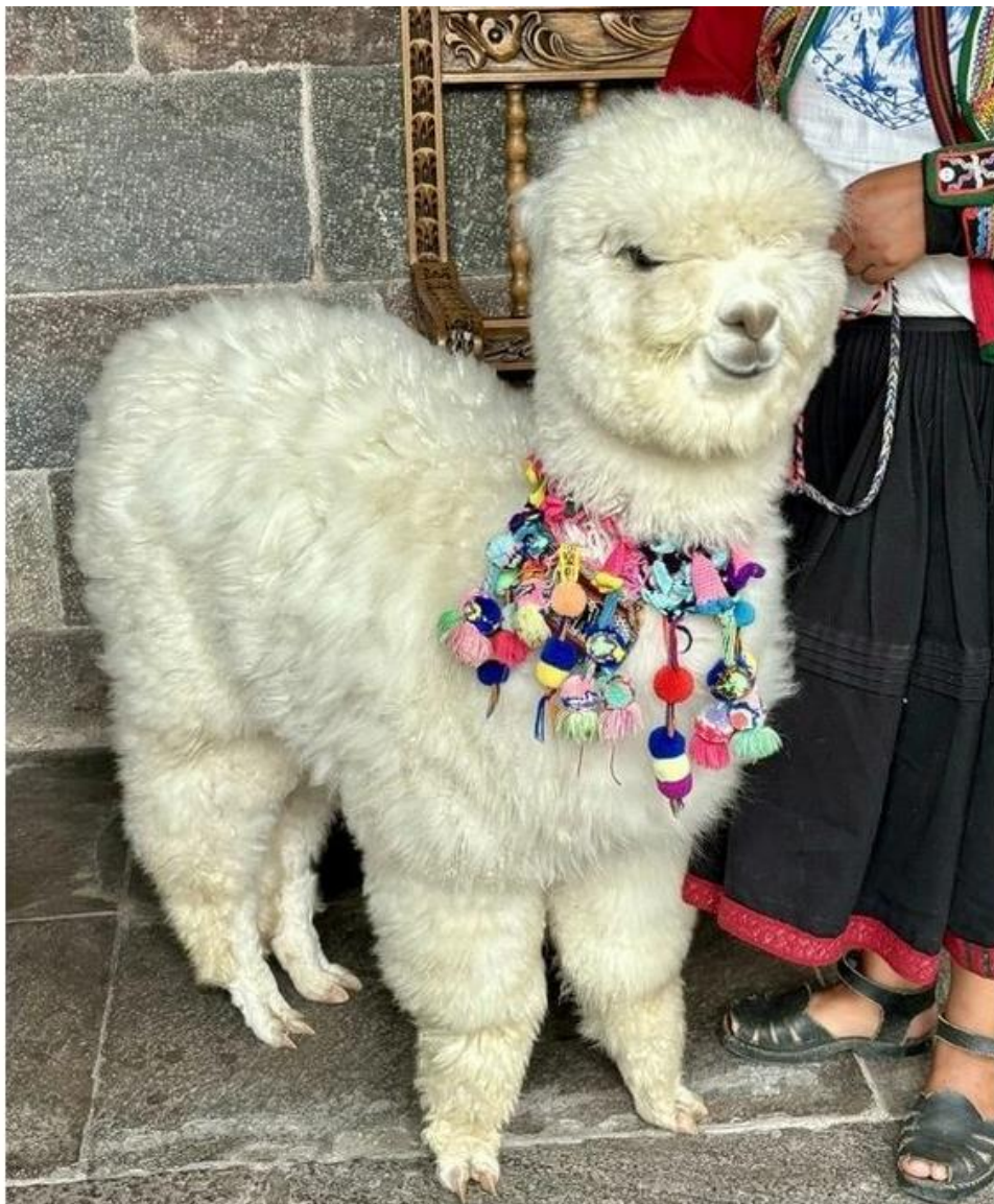
Pet a baby alpaca to start your day as a guest at Palacio del Inka, a Luxury Collection Hotel from Marriott in Cusco, Peru? Don't mind if I do!

– Dinner was in the courtyard of the Museo de Arte Precolombino at MAP Cafe, with walls of glass offering a refined view to match the elevated menu. The quinoa with avocado sour cream, braised baby vegetables, local cheese and arugula was divine.