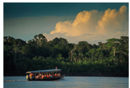
Madre de Dios River