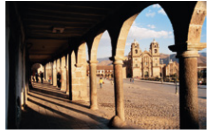
City of Cusco

Enjoy a complete breakfast in our Dining Room or if you prefer request it at your Suite. Take a private guided visit throughout the city of Cusco and its nearby ruins, where you will additionally visit the Cathedral, located next to the main plaza.