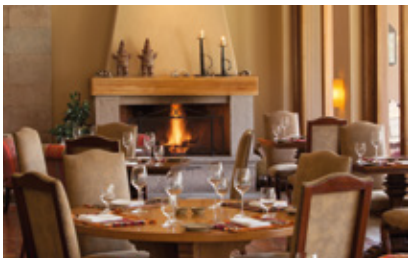
Dining Room at Hacienda Urubamba

Lunch, dinner and overnight at Inkaterra Hacienda Urubamba.