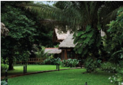
Inkaterra Reserva Amazonica

Arrive into Puerto Maldonado, coined the Capital of Biodiversity. A motorized wooden boat hugs the meandering river banks to reach your eco-lodge, Inkaterra Reserva Amazonica, ensconced in the heart of the rainforest.