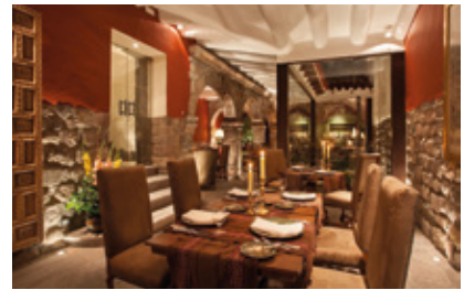
Dining Room at La Casona

Dinner and overnight at Inkaterra La Casona.