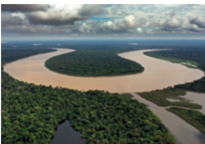
Madre de Dios River

Dinner and overnight at Inkaterra Reserva Amazonica.