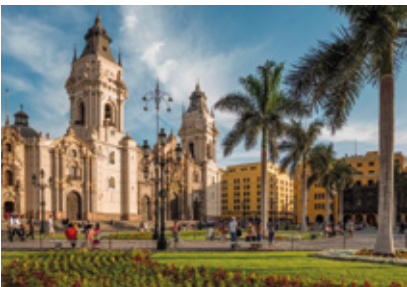
Plaza de Armas of Lima

Lima, the Spanish vice-royalty capital of South America, is home to some of the most remarkable colonial mansions, churches, and squares in the continent. The cosmopolitan districts of San Isidro, Barranco, and Miraflores offer a great variety of museums, restaurants and amazing shopping.