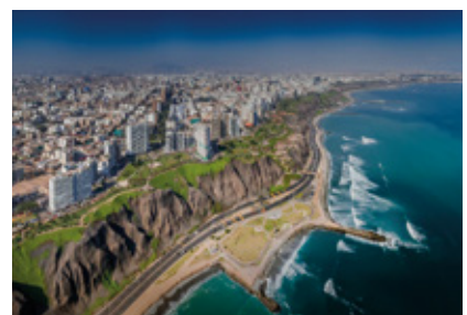
Costa Verde beach circuit

At due time, private transfer to Lima airport.