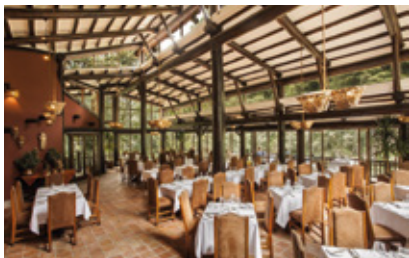
Dining Room at Machu Picchu Pueblo Hotel

Upon arrival into Machu Picchu Village you will be assisted to get to the hotel in the heart of the Machu Picchu Historical Sanctuary. You may choose from our in-house Eco-Activities: Birds, Nature Walk, Tea House or Twilight Walk. Dinner and overnight at Inkaterra Machu Picchu Pueblo Hotel.