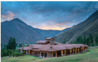
Inkaterra Hacienda Urubamba

Afternoon at leisure to rest and enjoy the activities available and overnight at Inkaterra Hacienda Urubamba.