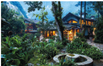
Inkaterra Machu Picchu Pueblo Hotel

DAY 3 SACRED VALLEY OF THE INCAS – MACHU PICCHU PUEBLO