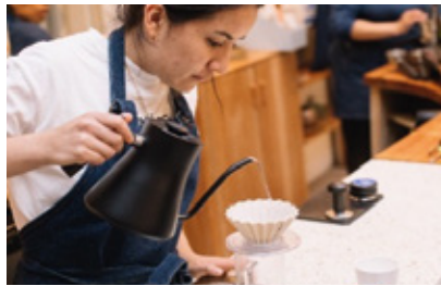
Florencia and Fortunata Cafe and Totemiq

Dinner and overnight at Inkaterra La Casona