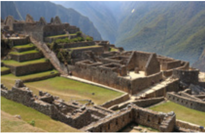
Machu Picchu Citadel

A half day excursion to Machu Picchu Citadel with your private explorer guide exploring the remains and surroundings, to experience the energy and atmosphere of one of the most significant and spectacular archaeological sites on the planet.