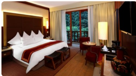
Deluxe suite at Sumaq Machu Picchu Hotel