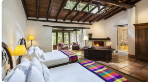
A twin suite at the Inkaterra Machu Picchu Pueblo Hotel