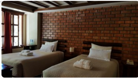
A twin share room at Panorama B&B