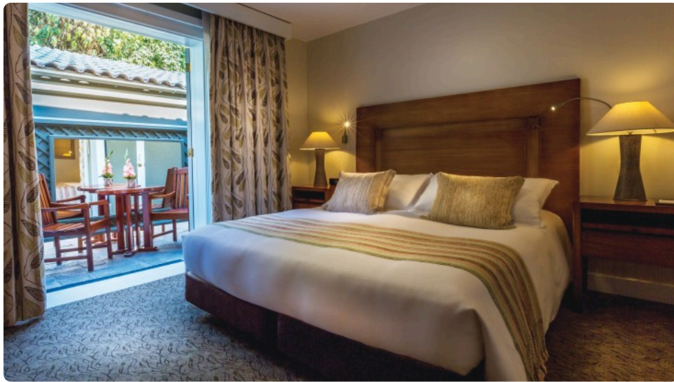
Room at Belmond Sanctuary