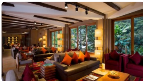
A cozy looking lobby at Sumaq Machu Picchu Hotel