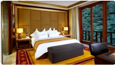
Imperial suite at Sumaq Machu Picchu Hotel