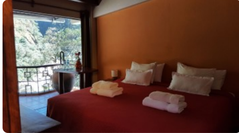
Room with a view at Panorama B&B