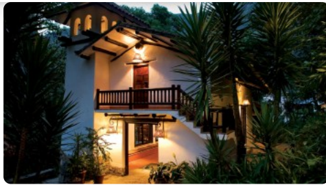
An evening outside the Inkaterra Machu Picchu Pueblo Hotel