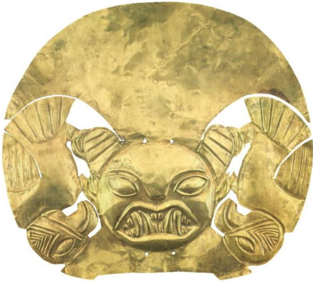
— FRONTAL ADORNMENT OF 18-KARAT GOLD HEADDRESS DEPICTING A FELINE HEAD WITH HALF MOON HEADDRESS AND TWO BIRDS/ COURTESY MUSEO LARCO/ AUSTRALIAN MUSEUM.