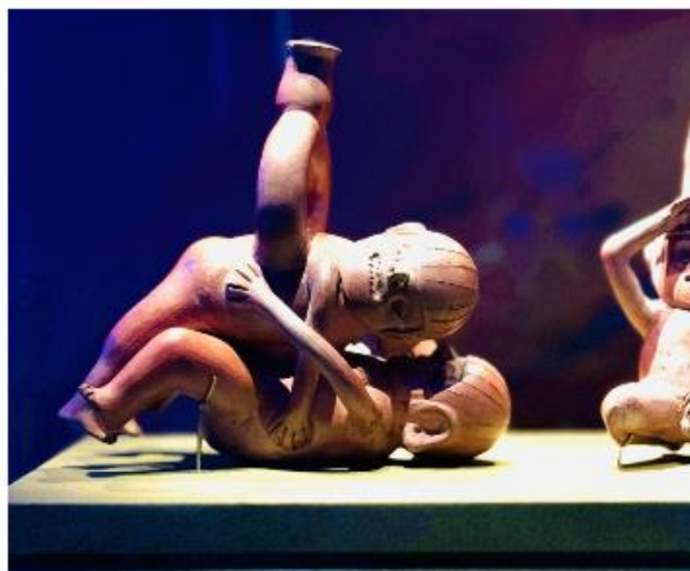
— 📷 IRRESISTIBLE IMAGES