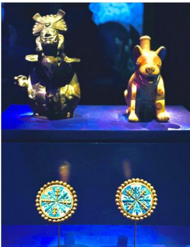
— IRRESISTIBLE IMAGES