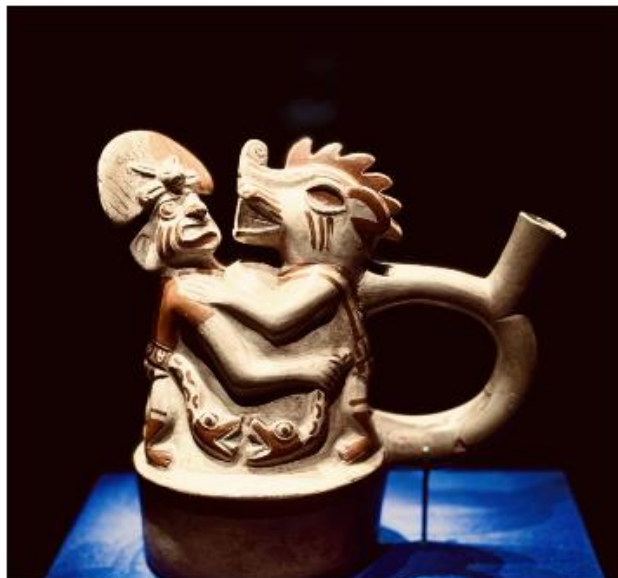
SCULPTURAL STIRRUP SPOUT BOTTLE DEPICTING AN ANTHROPOMORPHIC FIGURE WITH SUPERNATURAL TRAITS