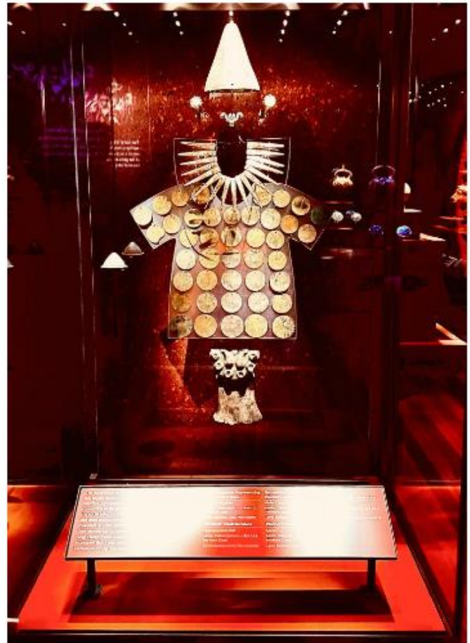
WARRIOR DRESS. SET OF FORTY-TWO CIRCULAR METAL DISCS OF GILDED SILVER. IRRESISTIBLE IMAGES

Moving away from threes, there's also plenty of twos, or to put it more archeologically, duality. There are beautiful metal vessels that are half gold and half silver; silver being the moon and gold being the sun. Plenty of other objects highlight two sides, representing rain and drought, man and woman, life and death, and of course, the overworld and the underworld.