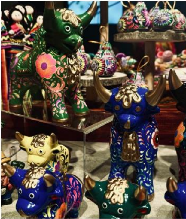
THE GIFT SHOP IRRESISTIBLE IMAGES