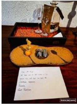
( https://travelseewrite.com/wp-content/uploads/2025/01/My-Cassita-at-Inkaterra-Hotel-Machu-Picchu-Peru.jpg ). A handwritten welcome letter along with goodies