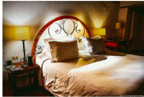
( https://travelseewrite.com/wp-content/uploads/2025/01/My-Cassita-at-Inkaterra-Hotel-Machu-Picchu.jpg ). Cosy and clean bed with warm lighting and alpaca wool blanket