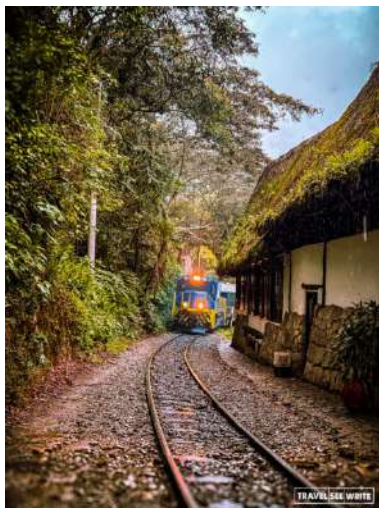
( https://travelseewrite.com/wp-content/uploads/2025/01/Machu-Picchu-Pueblo-formerly-Aguas-Calientes-train-at-Inkaterra-cafe-Peru.jpg )

A small overhead bridge that connects the Inkaterra Cafe with the hotel