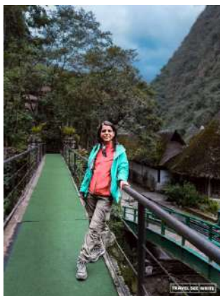
( https://travelseewrite.com/wp-content/uploads/2025/01/Going-to-Inkaterra-Cafe-Peru.jpg )

A small overhead bridge that connects the Inkaterra Cafe with the hotel