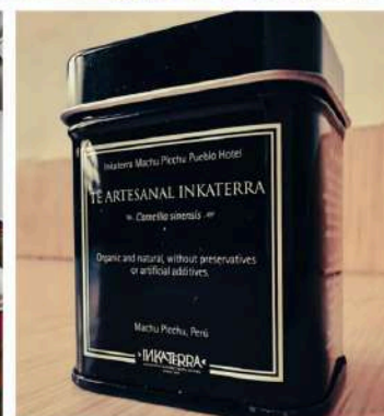
( https://travelseewrite.com/wp-content/uploads/2025/01/My-Peru-HOTEL-ROOM.jpg ).

The thoughtfulness of the Inkaterra staff was evident everywhere (L to R): cosy room, eco-friendly pouches, bathroom, slippers and special award-winning black tea in-house.