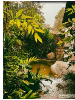
( https://travelseewrite.com/wp-content/uploads/2025/01/Outdoor-tub-at-Inkaterra-Hotel-Machu-Picchu-Peru.jpg ). My Inkaterra suite door opened to a garden and outdoor tub

The room welcomed me with a handwritten note from the hotel manager, delicious chocolates, a refreshing gooseberry, and a complimentary Pisco Sour bottle. It also featured a special award-winning organic black tea. Exclusively available at Inkaterra, this tea was honoured with the prestigious Medaille Gourmet Gold in 2023 and received a silver medal at the 7th Annual Teas of the World Awards in November 2024 in the 'Black Tea with Buds' category. Along with the tea, there were two small pouches, which came very handy in storing coins for the rest of my trip.