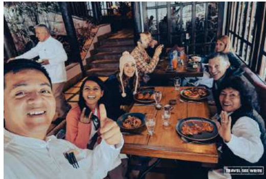
( https://travelseewrite.com/wp-content/uploads/2025/01/enjoying-our-lunch-at-Inkaterra-cafe-Peru.jpg )

While both were excellent, Cafe Inkaterra particularly stood out to me. Nestled between the train tracks and riverfront, it boasted the most elegant and intimate dining space in the area. As I crossed the train track to visit the café, I saw an Amazonian palm-thatched roof, large windows, and a contemporary design married with an Andean vibe. The service, mirroring that of the hotel, was impeccable. The restaurant, overlooking the Vilcanota River, showcased a menu ranging from Peruvian classics like lomo saltado (beef and potato stir-fry) to casual international favourites like lasagne and burgers. The breakfast buffet was equally remarkable, featuring fresh tropical fruits, pastries, and local specialities like tamales. The food truly stood out during my brief stay.