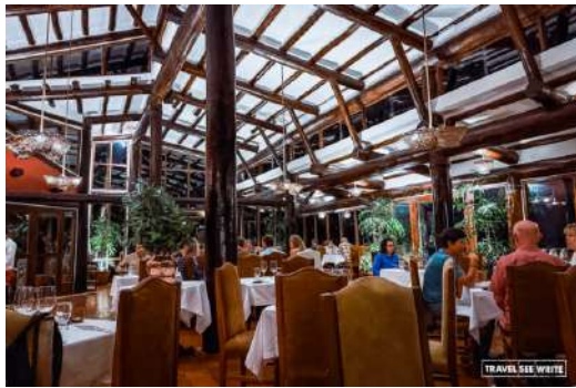
( https://travelseewrite.com/wp-content/uploads/2025/01/Inkaterra-Hotel-Bar-and-Dinning-Area-2.jpg )

Inkaterra. I had dinner and breakfast in the dining room and lunch at Café Inkaterra .